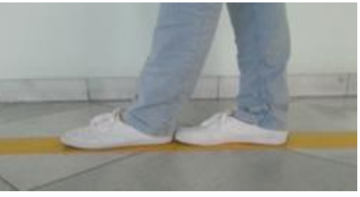
Rapid Paced Walk

The present study investigates the association between motor tasks (Rapid Paced Walk [RPW], Tandem Walking [TW] and Tandem Walking-reverse counting) and driving behavior in a Driving Simulator in patients with aMCI, mild AD and healthy individuals.