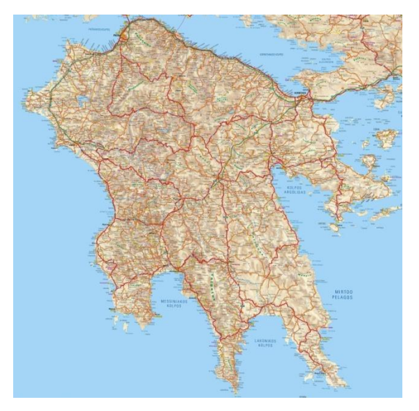
Figure 1. Map of the Peloponnese in South Greece