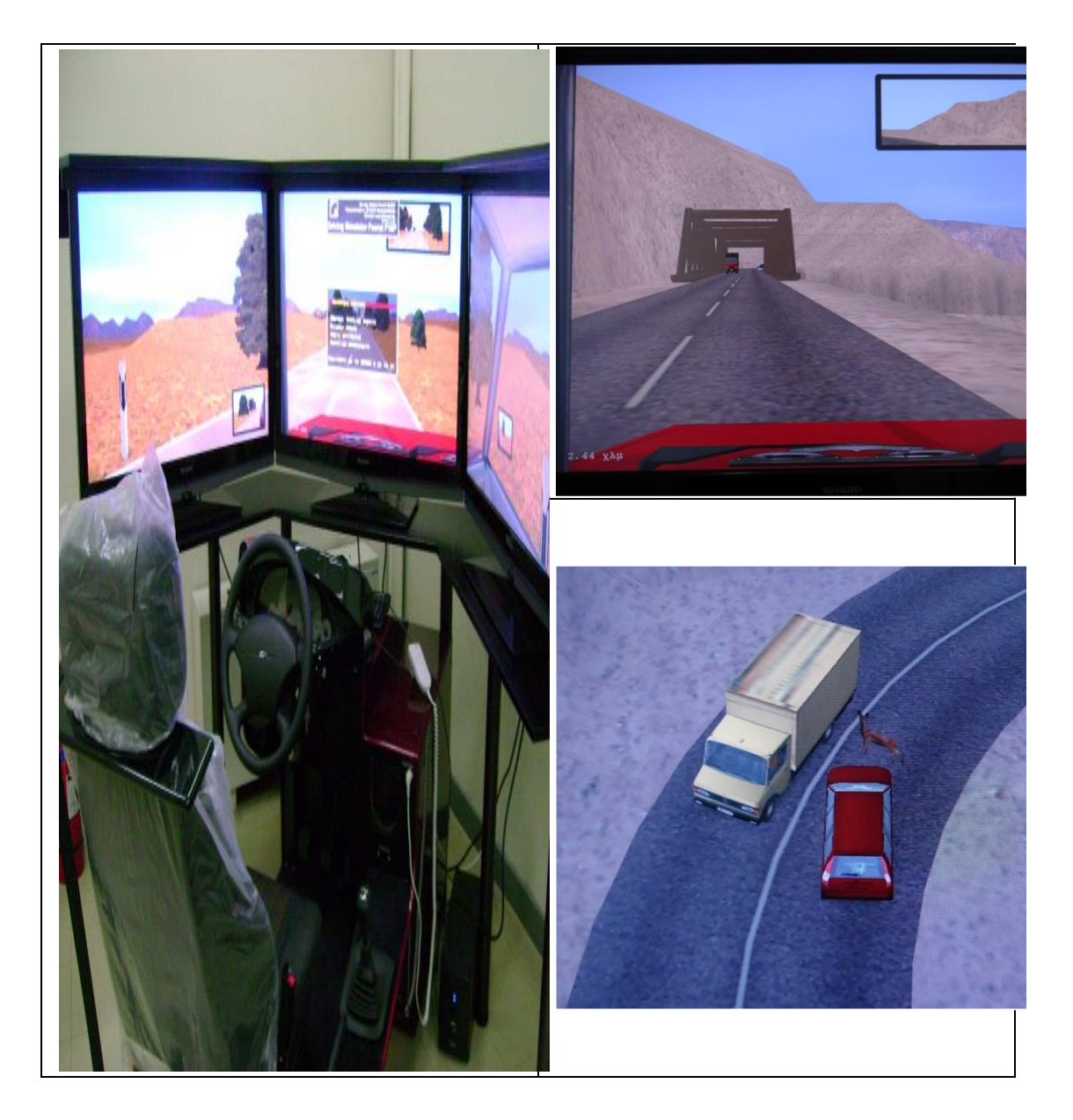
Figure 1. The NTUA driving simulator (left panel) – Simulated driving on a mountainous road and view of unexpected incident (right panel)

A series of experiments at the NTUA driving simulator (see Figure 1) was devoted to the investigation of the impact of mobile phone and other distraction sources on driver behaviour and safety.