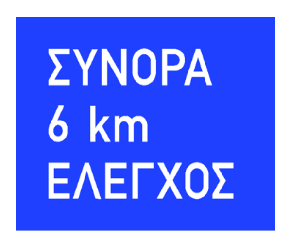
Fig. 1. Example message sign indicating border crossing 6 km ahead where drivers should stop for inspection.

Before each of the three drives in the simulator, subjects were instructed to respond to traffic control information and always maintain safe gaps with other vehicles just as they would when actually driving. They were also instructed to maintain a constant speed at the posted speed limit unless they encountered the road section where barriers were present. Specifically, they were told to try to "maintain a constant speed at the maximum posted speed limit for the roadway throughout the entire drive, unless you encounter road conditions where you must reduce speed to avoid hazards. In this situation, drive at what you feel is the maximum safe speed for conditions." They were also told by the experimenter, "At some point during this drive you will see a sign with a safety message displayed in white letters on a blue background. I will ask you to recall it at the end of the drive." An example is shown in Figure 1.