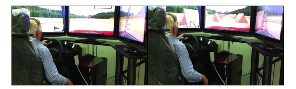
Fig. 2. Test condition TC2 (a:left) with a road works section visible in the distance; (b:right) as barriers narrow the road to a single lane.

Immediately after the end of each drive, subjects were asked to recall the safety message presented on the corresponding sign. The experimenter then assigned a score 0-3, indicating that none, 1, 2 or all 3 information units were recalled. With the exception of the distance unit, the accuracy of recall was assessed on the basis of the meaning of the message information, rather than the exact wording.