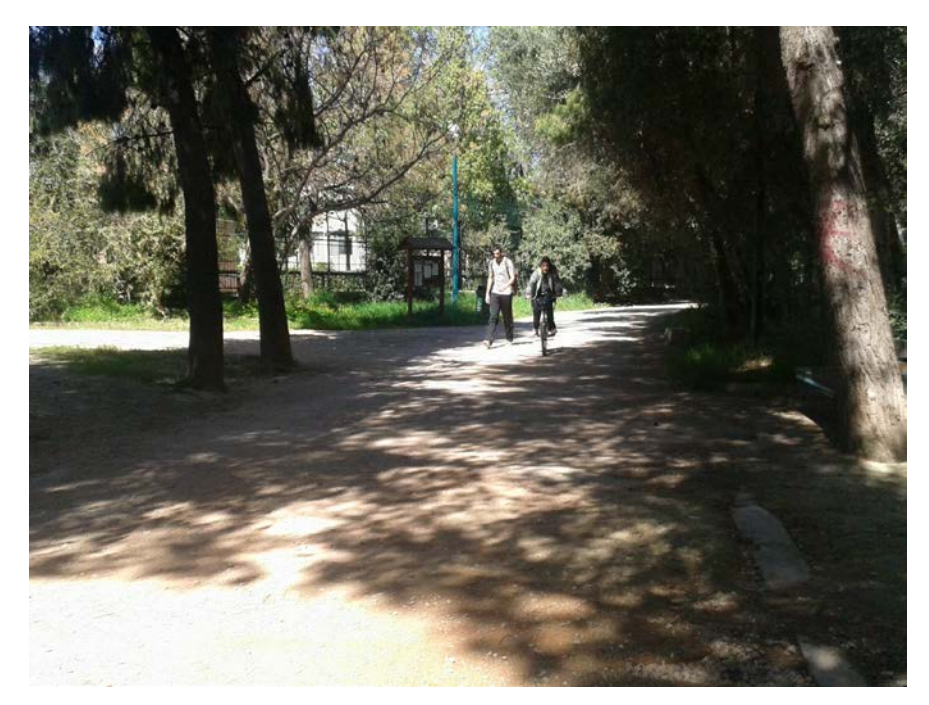
Figure 2. View of the park.