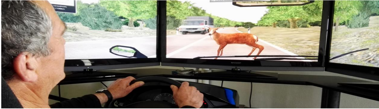
Figure 1. Unexpected incident in rural road

During each trial, 2 unexpected incidents were scheduled to occur during the drive (Figure 1). More specifically, incidents in rural area concerned the sudden appearance of an animal (deer or donkey) on the roadway, and incidents in urban areas concerned the sudden appearance of an adult pedestrian or of a child chasing a ball on the roadway or of a car suddenly getting out of a parking position and getting in the road. The hazard did appear at the same location for the same trial (i.e. rural area, high traffic) but not at the same location between the trials, in order not to have learning effects. Regarding the time that the hazard appeared, it depended on the speed and the time to collision, in order to have identical conditions for all the participants to react, either they drove fast or slowly. The accident risk was calculated as the proportion of the total incident crashes to the total incidents happened.