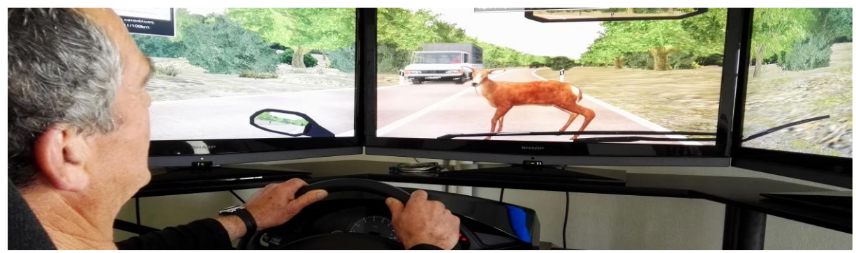
Figure 1. Unexpected incident in rural road

During each trial, 2 unexpected incidents were scheduled to occur during the drive (Figure 1). More specifically, incidents in rural area concerned the sudden appearance of an animal (deer or donkey) on the roadway, and incidents in urban areas concerned the sudden appearance of an adult pedestrian or of a child chasing a ball on the roadway or of a car suddenly getting out of a parking position and getting in the road. The hazard did appear at the same location for the same trial (i.e. rural area, high traffic) but not at the same location between the trials, in order not to have learning effects. Regarding the time that the hazard appeared, it depended on the speed and the time to collision, in order to have identical conditions for all the participants to react, either they drove fast or slowly. The accident risk was calculated as the proportion of the total incident crashes to the total incidents happened.