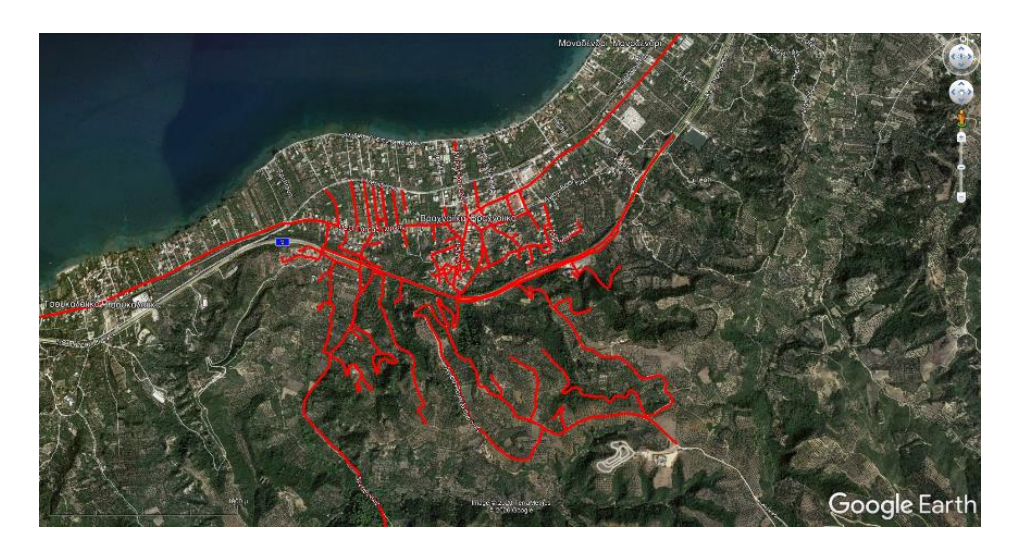
Figure 2: Blender and GPS Visualizer data assessment area.