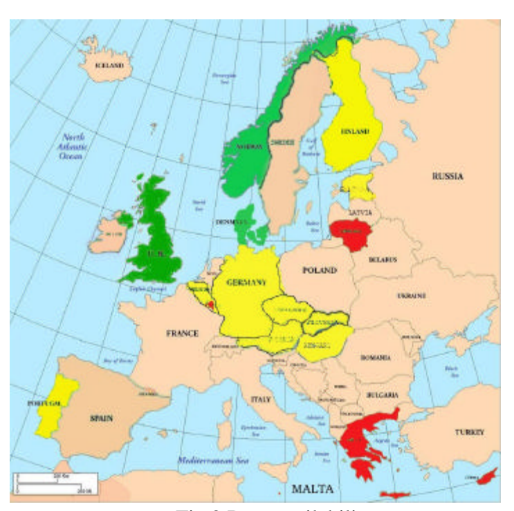
Fig 2 Data availability

The preliminary results are the following: in 3 countries data is fully available, 12 in countries data is partially available and in 5 countries data was not available. Data is partly available in a lot of countries because the data is not collected for all transport types: in most cases bicycles, mopeds and/or trams are missing.