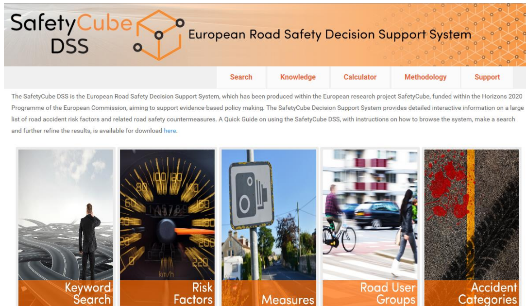
Figure 1: Main menu and entry points of the DSS.

The SafetyCube DSS Search is structured in three operational levels (with Level 0 being the system Home Page), as shown in Figure 2: Level 1 includes the Search Pages, Level 2 includes the Results Pages and Level 3 includes the Individual study pages. These are further described below (for a full description, see Yannis & Papadimitriou, 2018).