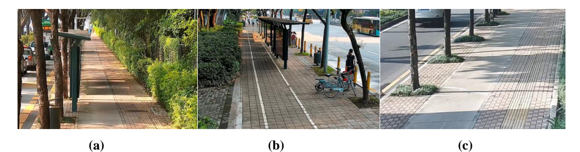
Figure 1. Layout of the observed locations: (a) Lianxin Street; (b) Caitian Street; (c) Huanggang Street. A total of 4426 road users were observed, and approximately 15 % of these road users (674 road users) were involved in a conflict. Specifically, 163 conflicts on Lianxin Street, 137 conflicts on Caitian Street, and 35 conflicts on Huanggang Street were recored. Traffic volume was counted by humans and a 15 min counting interval was used. The traffic volume of pedestrians, conventional bicycles and e-bikes were counted, respectively. All the variables consided in the logit model are shown in Table 3. Table 3: Descriptive statistics for variables

Three shared space in Shenzhen city was selected for this study and shown in Fig. 1. 7:30–9:30 and 17:30–19:30 were the morning and evening peak periods, that is, the periods when traffic conflicts are most likely to occur. The video recordings of these two 2-h periods at the three shard space were obtained. The frame rate of the video was 25 frames per second. The video resolution was 1920 \times 1080 pixels.